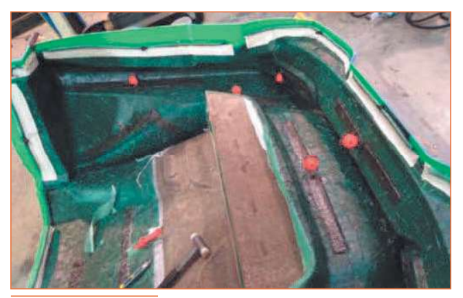
Fig. 5: Before the mould dismantlement stage