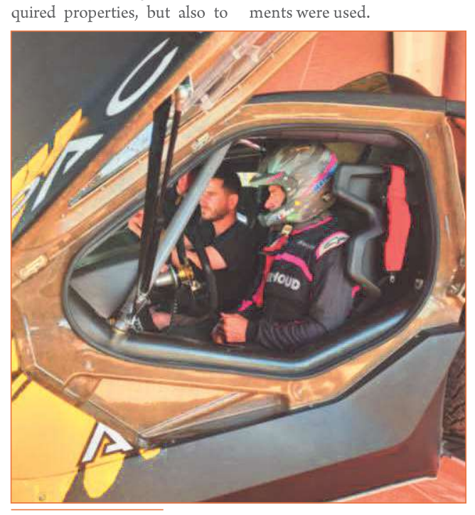
Fig.4: Flax-reinforced door

Once these moulds centred and bolted together, a bonding element is added to ensure a seal and prevent leakage during vacuuming, It confirms the quality of the assembly and preparation of the parting lines. Figure 5 shows