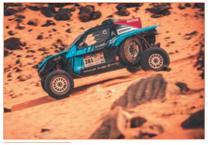
Fig. 1: Composite-bodywork T3U in the desert

Due to strong weight limitations and its environment-friendly approach, Apache Automotive was aiming for biobased composite bodyworks, and thus chose to collaborate with VESO Concept (Veso) (Occitanie, France). Acronym of "vehicle,