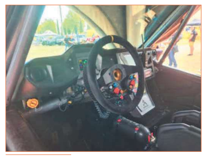
Fig. 3: Equipped dashboard integrating recycled carbon mat © VESO Concept

to its very low environmental footprint, in accordance with Veso's DNA, but also for its low weight and damping properties (Figure 4). Moreover, this natural fibre is available under different forms, as fabrics and mats. Basalt was used for the interior parts and for the rocker panels, due to its high mechanical properties.