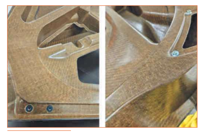
Fig.5: Assembled flax-based door interior

consumables being pulled out of a rear bonnet after infusion and before mould dismantlement.